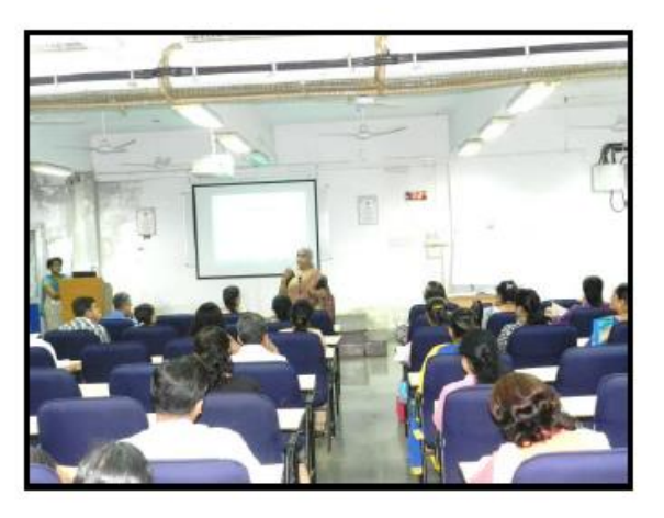
HOD addressing Parents- Proctor Meeting