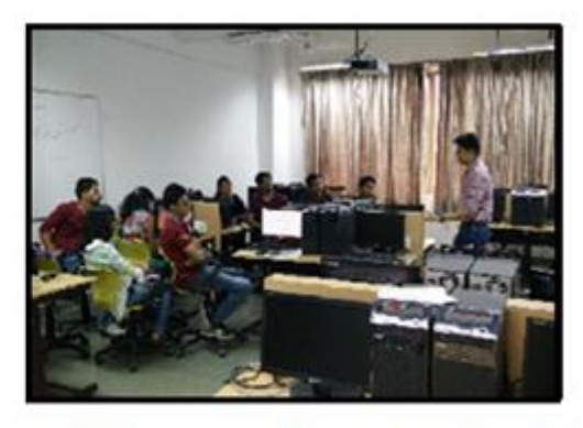
Lecture session on IPR and Patents for PG Students