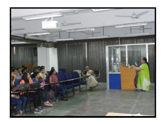
Orientation Course on IDC