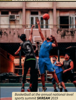
Basketball at the annual national-level sports summit SKREAM 2019