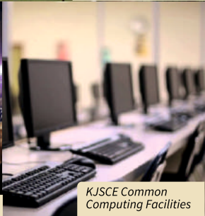
KJSCE Common Computing Facilities