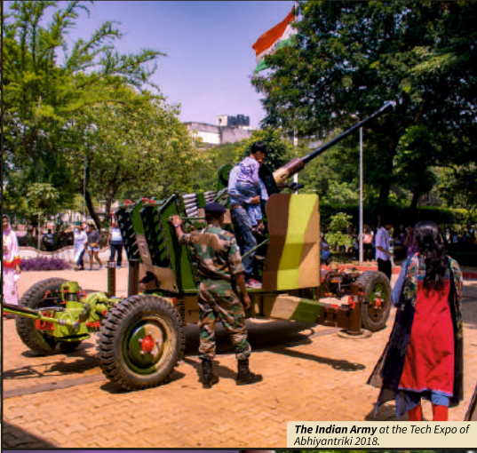
The Indian Army at the Tech Expo of Abhyantriki 2018.