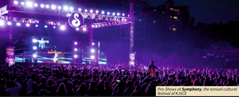
Pro-Shows at Symphony , the annual cultural festival of KJSCE

KJSCE tries to provide to the curious & artistic minds of students with its in-house activities. It hosts many international chapters (like CSI, CodeCell, IEEE etc.) for technical committees as well as a plethora of events & cultural clubs for art, dance, drama & literature, etc.