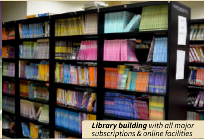
Library building with all major subscriptions & online facilities