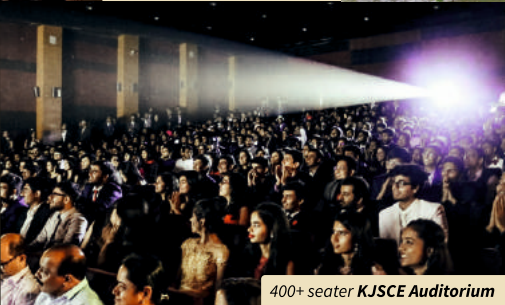
400+ seater KJSCE Auditorium