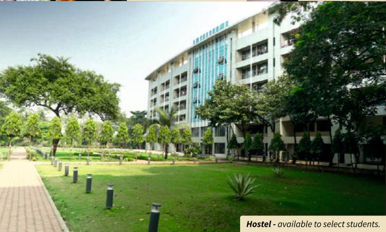
Hostel - available to select students.