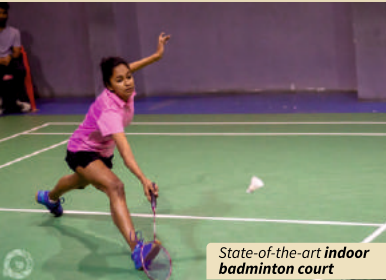
State-of-the-art indoor badminton court

KJSCE has well equipped labs, multiple common computing facilities, library spread over 4 floors, indoor sports facilities such as a badminton court, carom room, table-tennis rooms. etc. Additionally, the Somaiya Vidyavihar Campus is host to multiple top-of-the-line facilities including, full sized football grounds, tennis courts, fully-featured hostels, etc. The campus is always connected to high speed Wi-Fi (850 Mbps)