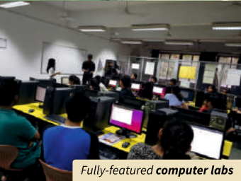
Fully-featured computer labs