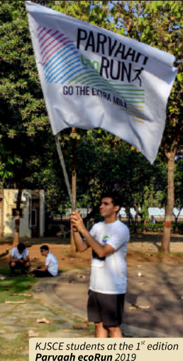
KJSCE students at the 1 st edition Parvaah ecoRun 2019