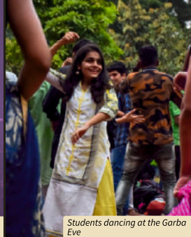
Students dancing at the Garba Eve

KJSCE is affiliated to the following national & international campus chapters -