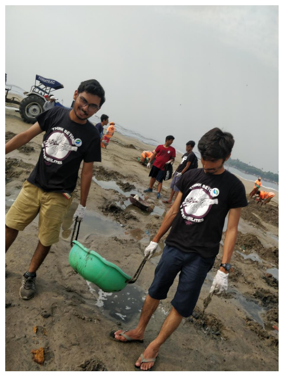
Volunteers hard at work