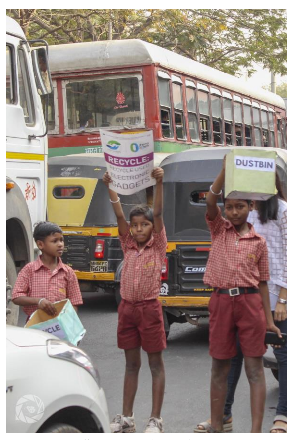
Street act in action

Parvaah bags were also distributed during this campaign to promote the use of cloth bags over plastic bags. We hope that this influenced the passers-by to actively make changes in their lives and this campaign was an overall success.