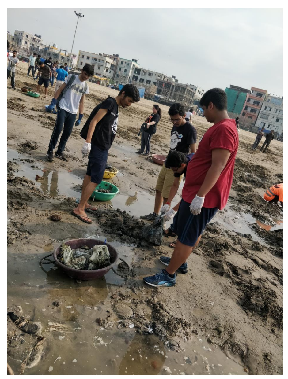
Volunteers collecting garbage