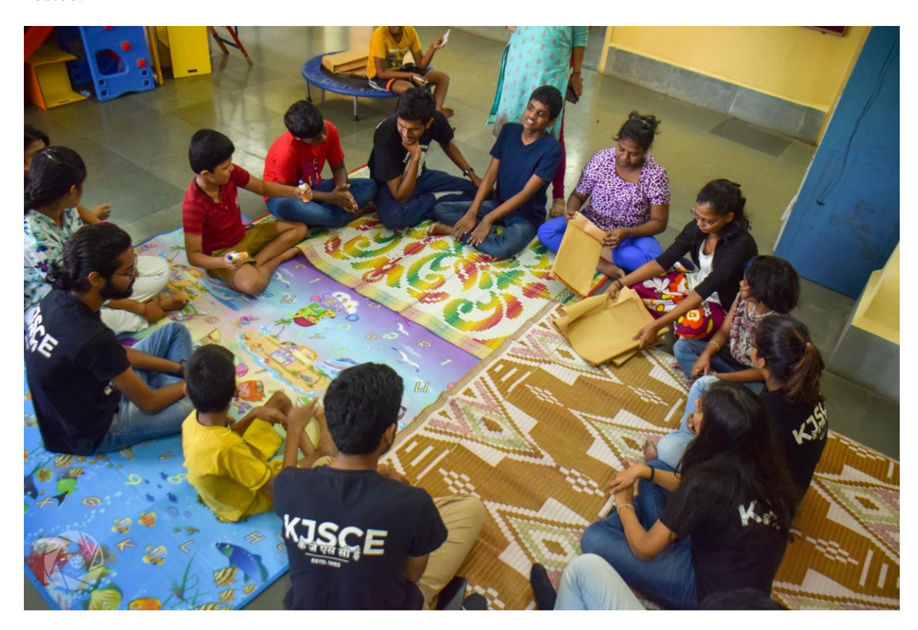
Paper bag making session with the children

the children how to make paper bags from paper and a paper bag making competition was hosted.