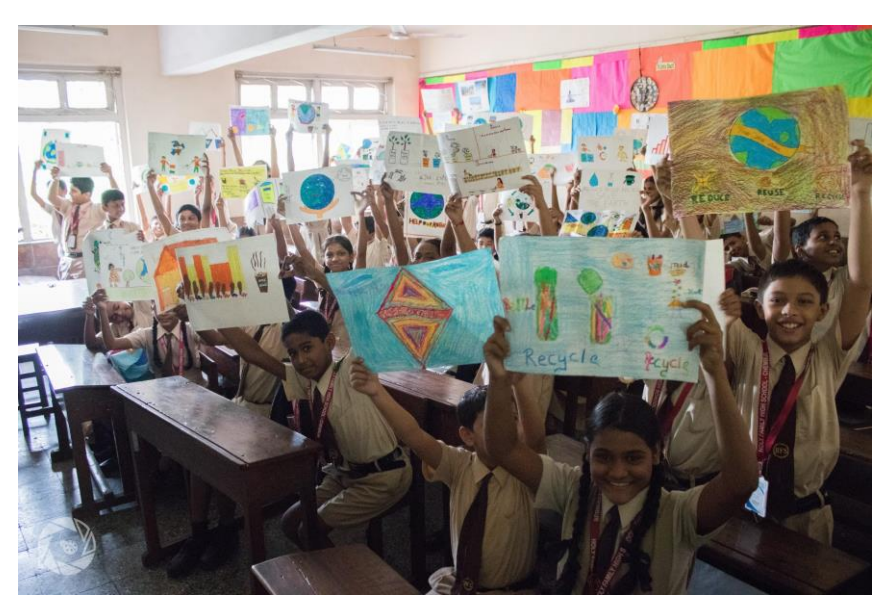
The students proudly displaying their drawings