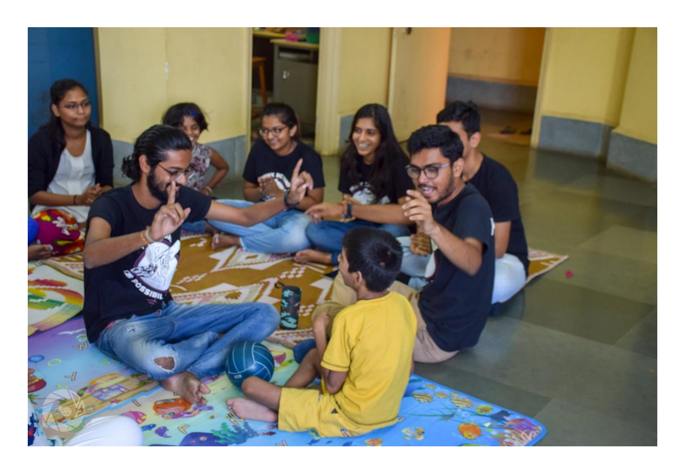
Members from Parvaah play with the kids at the orphanage.

The members of the KJSCE Students' Council, under the banner of their social initiative, Parvaah, visited an orphanage named 'Vatsalya Trust' for its event 'Diwali Orphanage Visit' on the 10th of November 2018. Vatsalya Trust is situated in Kanjurmarg, in Suburban Mumbai. 6 members from team Parvaah spent time with the kids of the orphanage from 2:30 to 4:30 on the occasion of Diwali.