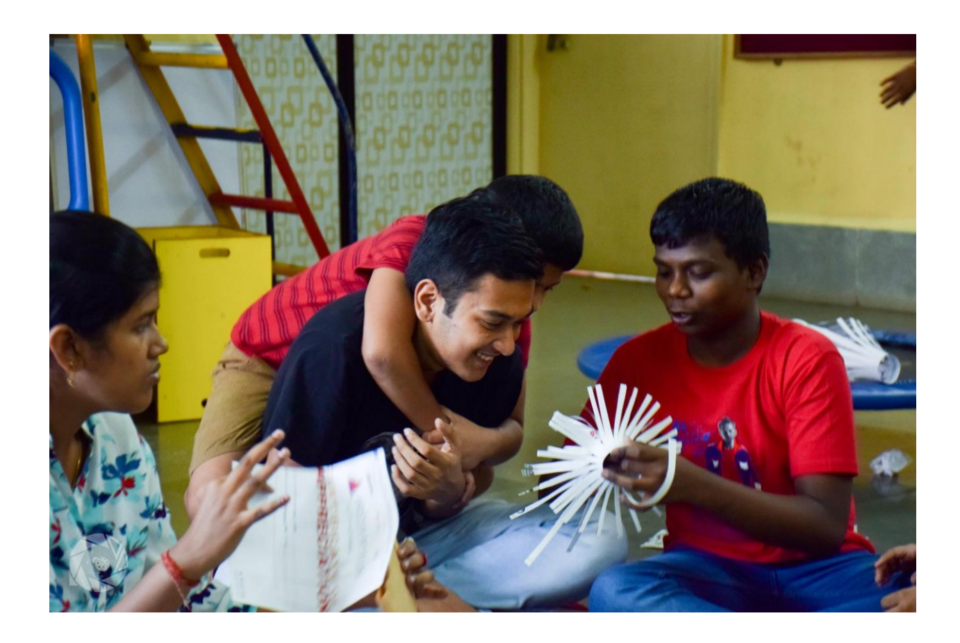
The children enjoy while making lanterns for Diwali.

(Autonomous College Affiliated to University of Mumbai)