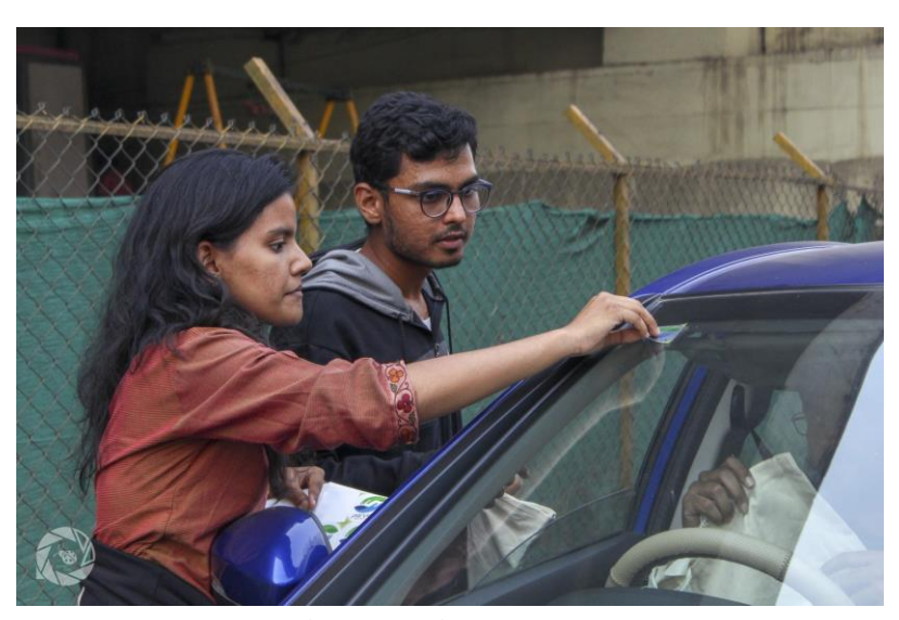
Parvaah stickers being stuck on cars