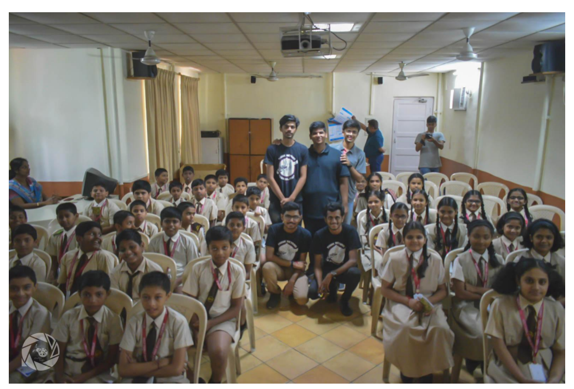
Team Parvaah with the students

(Autonomous College Affiliated to University of Mumbai)