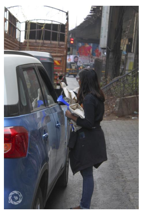
Parvaah hampers being distributed