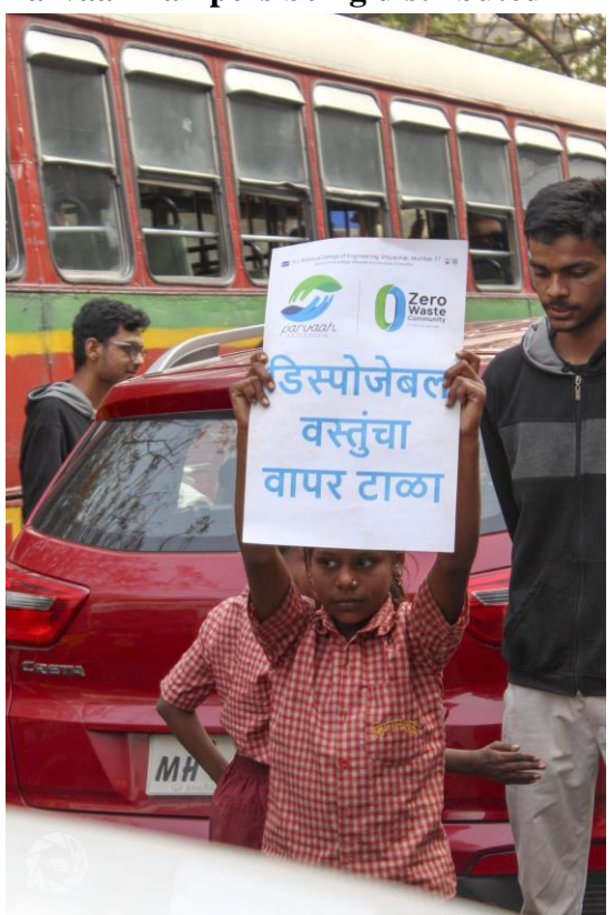
Children condemning the use of disposable waste