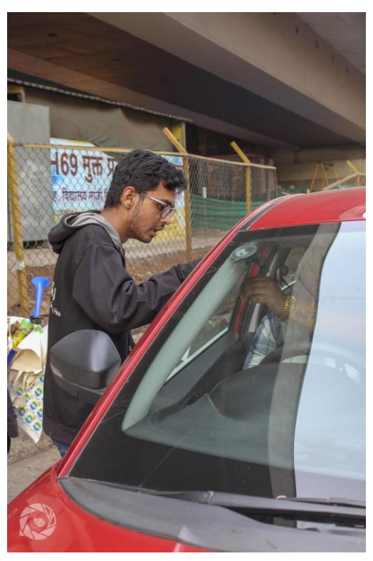
A volunteer convincing a motorist to switch off the car engine at the signal