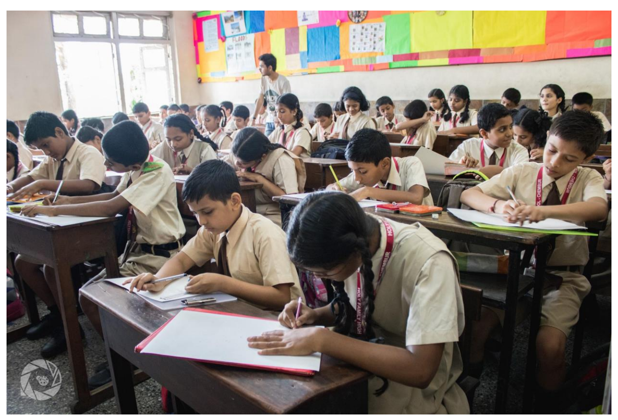
The students put their creative minds to test in the drawing competition

(Autonomous College Affiliated to University of Mumbai)