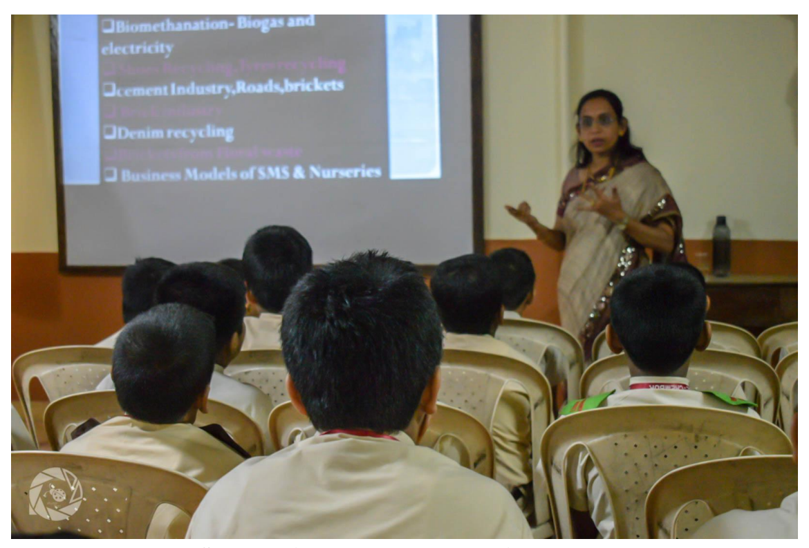
Students listen keenly as the session goes on

met by a rapturous response. The session concluded with a doubt session with the students. While leaving, every student was handed a Parvaah bag as an effort from team Parvaah to promote the use of cloth bags.