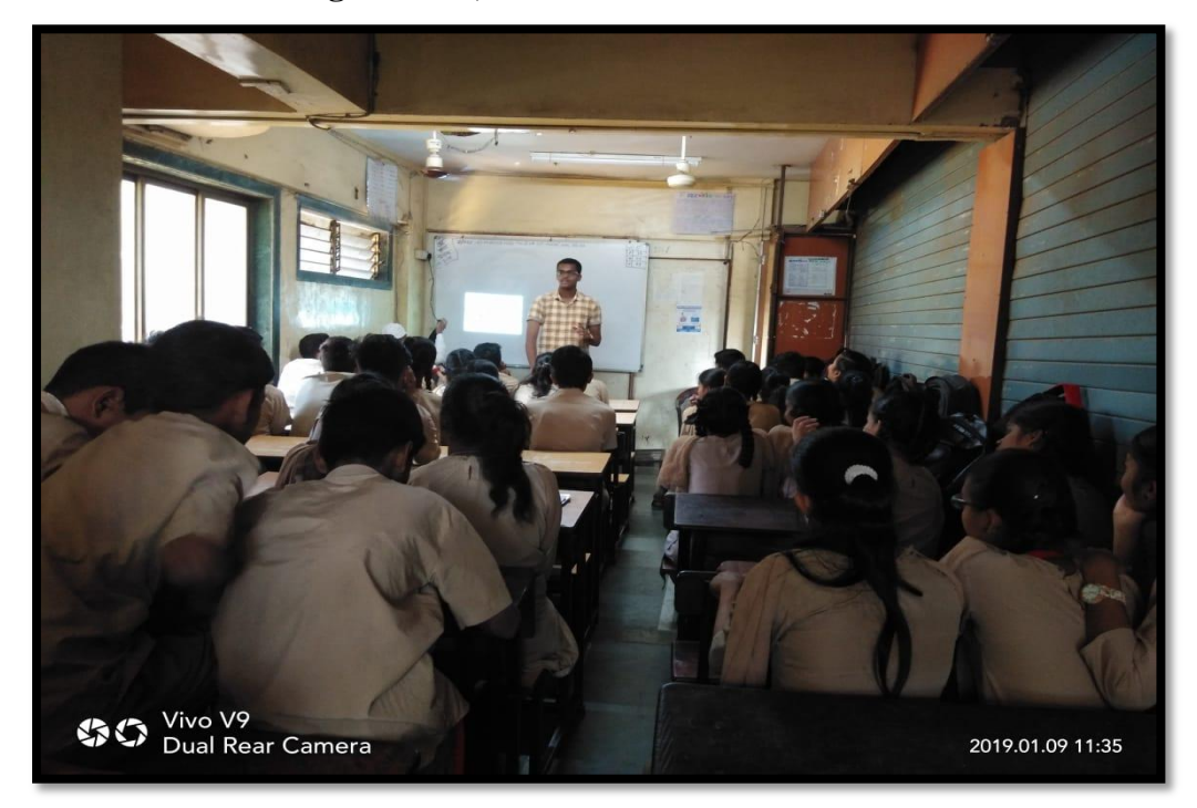
Plus Point Merit High School, Govandi

(Autonomous College Affiliated to University of Mumbai)